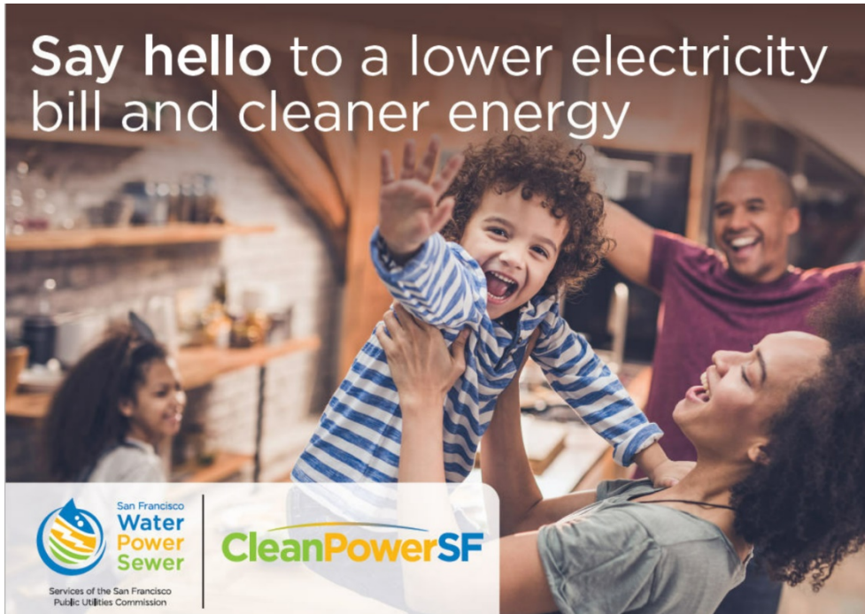
Figure 1. SuperGreen Saver Enrollment Notice (Front)

Staff have also been working on other implementation activities to make the Disadvantaged Communities Green Tariff program available to customers in mid-March. CleanPowerSF and External Affairs staff collaborated to develop a product name for CleanPowerSF's DAC-GT program: "SuperGreen Saver". SuperGreen Saver emphasizes both the renewable energy content of the product and the cost savings available to participants. As shared in previous updates to this Commission, customers who are currently enrolled in the Arrearage Management Plan (AMP) and located in a SuperGreen Saver-eligible census tract will be automatically enrolled into SuperGreen Saver program. Staff are preparing to send physical and electronic mail notifications to customers in late-January, and a second round will be sent in mid-February. CleanPowerSF expects to auto-enroll approximately 400-500 customers that are also enrolled into the AMP program. Additional customers that are not enrolled in the AMP program but meet all other eligibility criteria will also be able to enroll in SuperGreen Saver, as space in the program permits. A copy of the enrollment notification that will be sent to all eligible customers is provided in Figures 1 and 2 below.